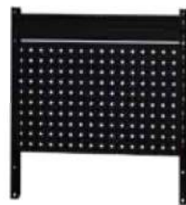
W61 656W x 32D x 700H mm