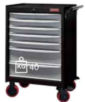
TC-25 680W x 460D x 1015H mm KG 400 TPR 5" caster