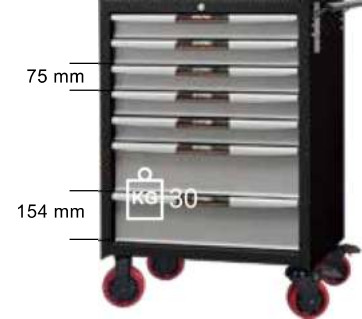
TC2-L25 671W x 460D x 975H mm KG 400 TPR 5"caster