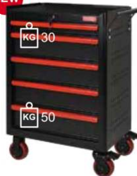
TC5-41B 778W x 500D x 980H mm KG 400 TPR 5" caster