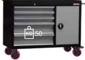
TC4-511 1117W x 600D x 836H mm KG 400 TPR 5" caster