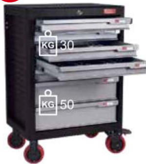
TC3-L25 743W x 500D x 988H mm KG 400 TPR 5" caster