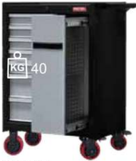
TC-H25 680W x 460D x 1015H mm KG 400 TPR 5"caster