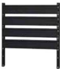
W60 656W x 32D x 700H mm