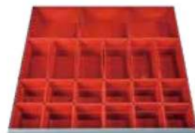
SHUTER SB Square Box set included