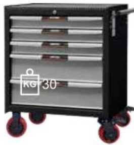
TC2-M23 671W x 460D x 820H mm KG 400 TPR 5"caster