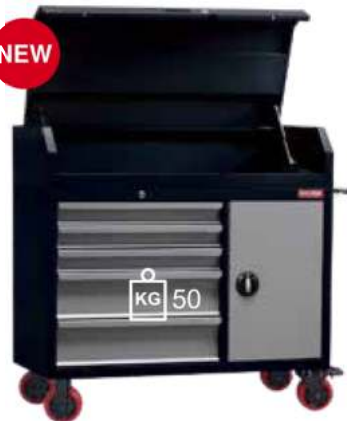
TC4-513 1117W x 600D x 1028H mm KG 400 TPR 5" caster