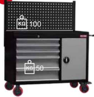
TC4-512 1117W x 630D x 1291H mm KG 400 TPR 5" caster