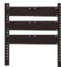
W63 656W x 32D x 700H mm