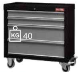
TC-S22 671W x 347D x 650H mm KG 200 PP 3"caster

* Height measurement includes casters and handles