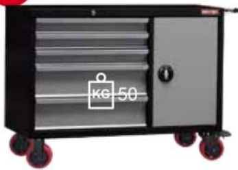
TC4-510 1117W x 600D x 800H mm KG 400 TPR 5" caster