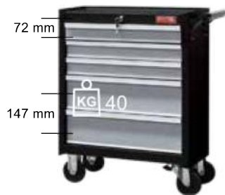
TC-S23 570W x 342D x 779H mm KG 200 Rubber 4"caster